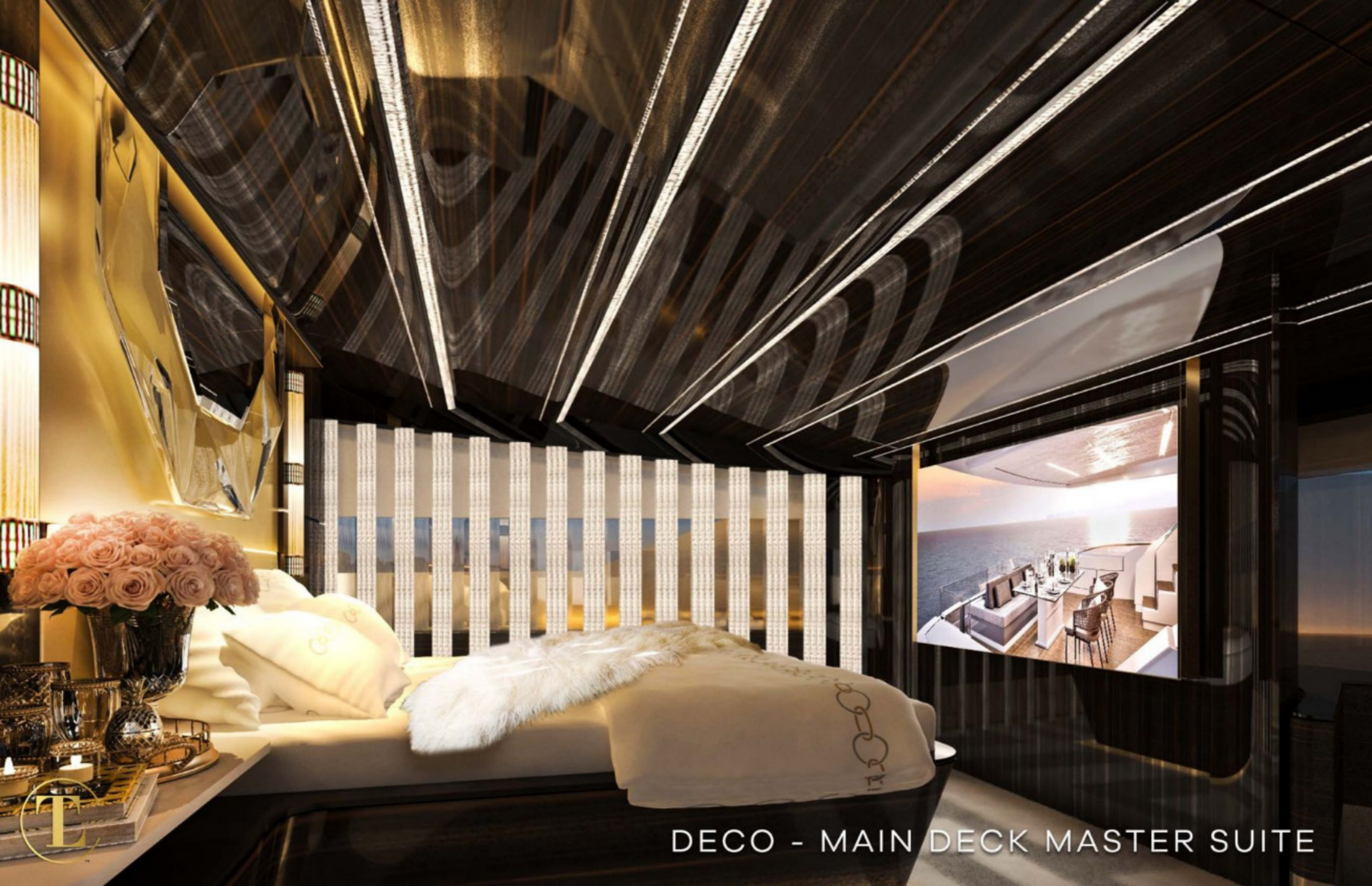
DECO - MAIN DECK MASTER SUITE